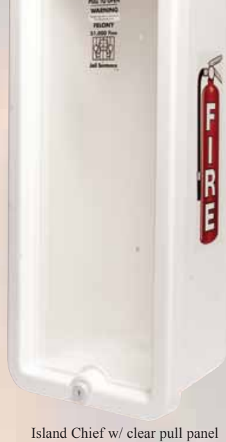
"Tampering is a Felony" label 5 or 10 lb. extinguisher sizes.