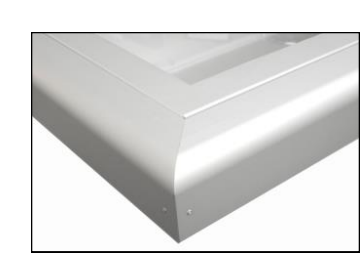
Extruded Rolled Edge 3627, 3622, 3728