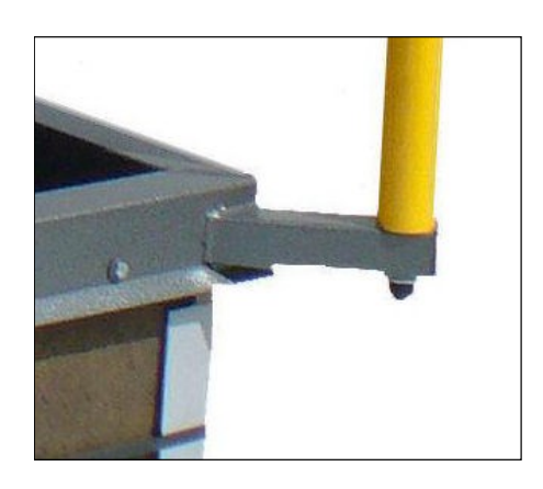
Rail Supports are Welded to Curb