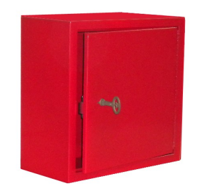
SVC-13 With Optional Color

New—Deeper SFC 11 & 12, SSFC 31 & 32 Cabinet Now Fits 10 lb Cosmic and Galaxy!!