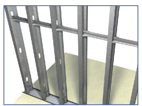
BuckleBridge used in load bearing walls with BuckleBridge works just as easily with back-TSN's SigmaStud