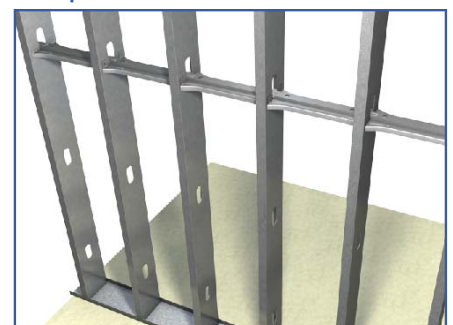
When using BuckleBridge in curtain walls with standard "cee" studs, one screw is only needed every 3rd stud.*