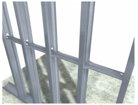
US Patents #7,596,921, #7,836,657 & #8,205,402