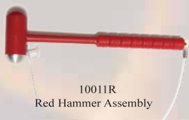
10011R Red Hammer Assembly