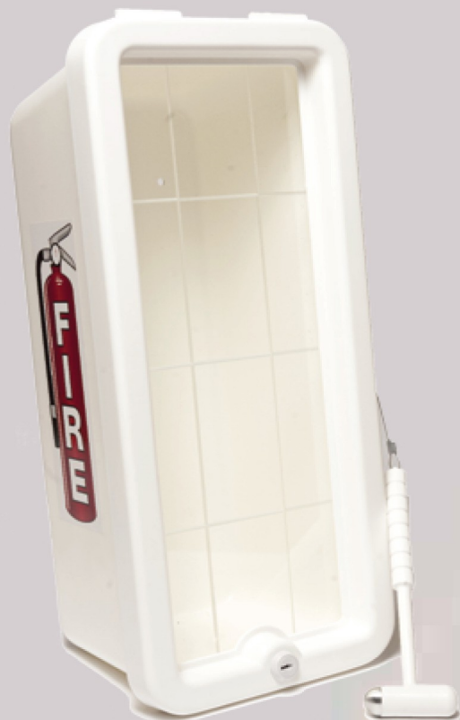
Chief 105-5 WWC-H