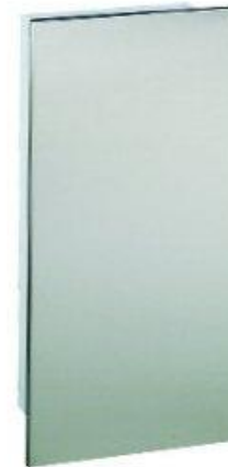
5634S21 Stainless Steel