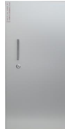
5634L22 Stainless Steel