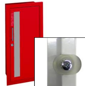
Breakable Plastic Cam

The SAF-T-LOK™ cam lock is centered top to bottom on the cabinet door, and can be installed on most door styles with the glazing option you select. Pull handles are installed 3-5/8" inches higher when a SAF-T-LOK™ is installed in your cabinet, except for the ADA recessed pull which is installed to the right of the lock. See page 2 for more information on the SAF-T-LOK™