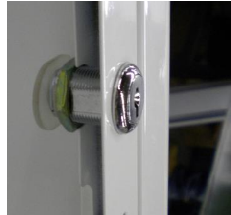
SAF-T-LOK™ In Locked Position