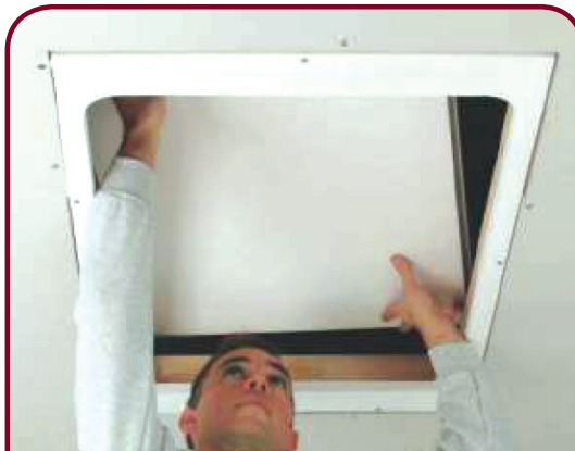
3. Install drywall and place access panel in opening.