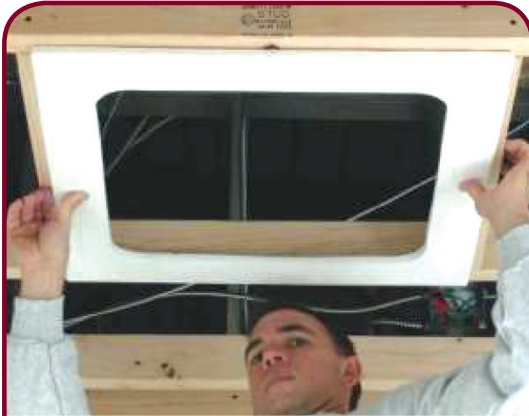
1. Frame the opening.