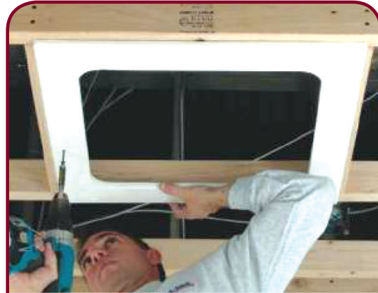
2. Mount Stealth surround with drywall screws.