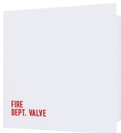
MODEL FRC8220 (Shown)