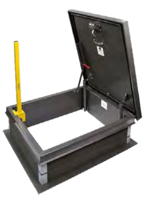
EZ-UP Ladder Post LP-6 in raised position