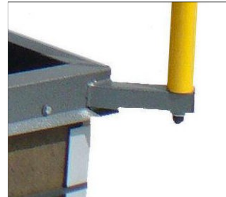
Rail Supports are Welded to Curb