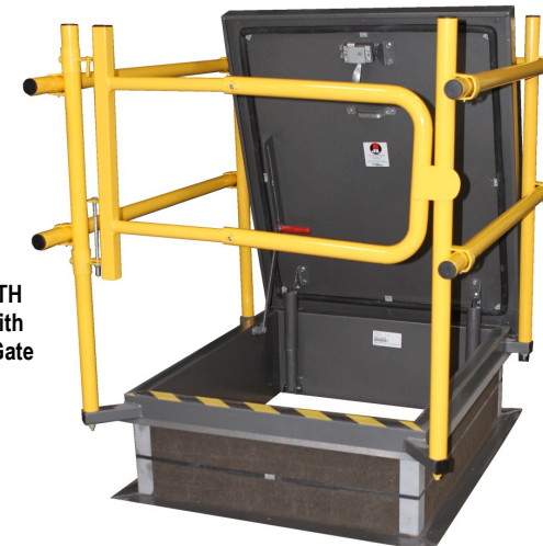
RHG-1-STH Shown with Optional Gate

___ Ladder Posts ___ LP-4 ___ LP-5 ___ LP6 (see separate submittals for more information)