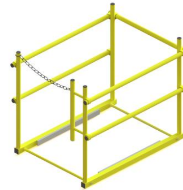
SHWC-3636 SHOWN WITH STANDARD GRAB BAR (Standard with 36" and Greater Egress Side Opening)