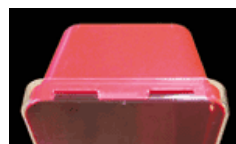
Warrior RC Red body Clear cover