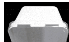
Warrior WC White body Clear cover