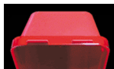
Warrior RR Red body Red cover