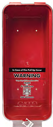
Warrior 95-10 RC

Cato's affordable fire extinguisher series, manufactured in the U.S., provides a dent and rust proof alternative to metal. Cato's Warrior series fire extinguisher cabinet is a two- piece construction with a locking seal. No additional padlock is required. Simply pull up to break the seal and remove the cover to access extinguisher inside.