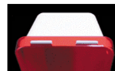
Warrior WR White body Red cover

It is the responsibility of the customer to communicate specifications and product performance requirements that are needed for their application. This document is intended to convey potential product configurations and offerings. It is not to be used to imply or represent a specification or rating, of finished products shipped. Detailed, specific submittals can be created upon request. It is the responsibility of the customer to specify product accordingly to comply with local laws, codes, and ordinances.