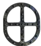
Fire Extinguisher Tray Accessory